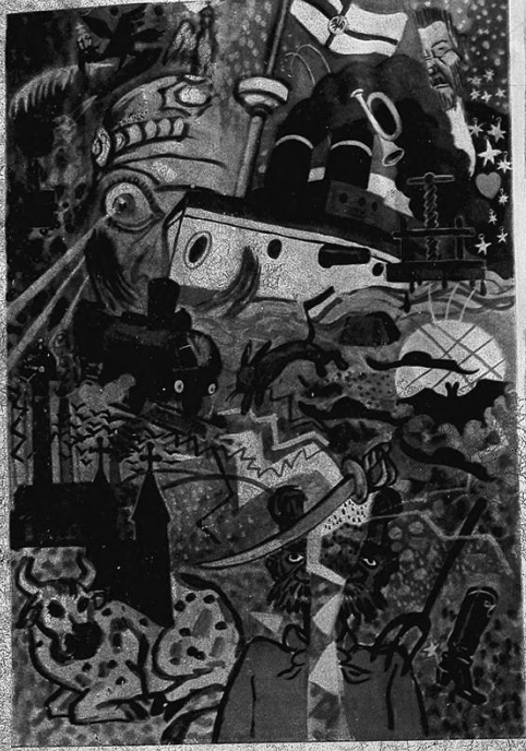
Oben: Gemälde gibt die Gesamtschau wieder, unten: der Weltbild der futuristischen Technik enthält.