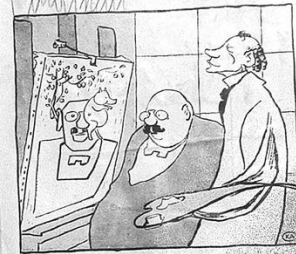
Das „Dorffrat“ des Futuristen

„Dorffrat, auf meine 11. 12. 13. ist es die Welt, die ich nicht mehr sehen will...“