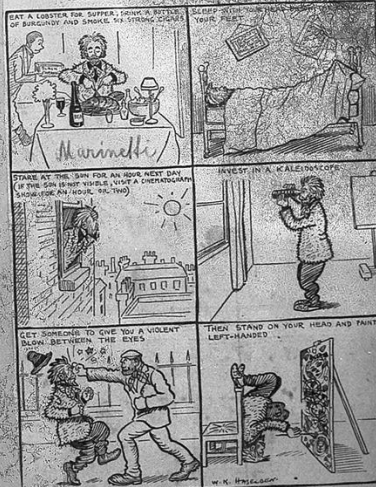
Painting pictures with a diminished sense of straight lines and colors. Presumably they are painted from some such inspiration as follows from Central blindness, indigestion, and sick headaches.