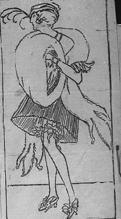
La moda de mañana... a juzgar por la alarmante dimensión de ropa que exigen los modelos de día.