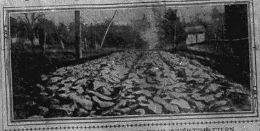
BROOME COUNTY'S 'FUTURIST' ROAD. 'CUBIST' PATTERS.