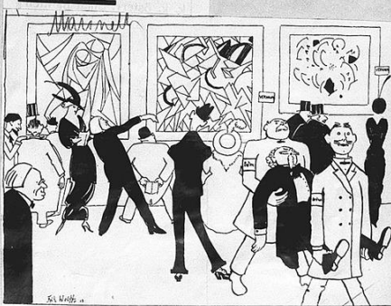
Die Eröffnung des 'Archivates' in Berlin (Anschauung der Zuschauer, Publikum und Exponanten)

Ausschnitt aus: Zeit im Bild, München-Wien vom: 1913