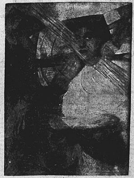
'Stradivari i Klampenborg'.

Figur: Boccioni, som utställer sina... (The text discusses the artist's work and the Futurist movement.)