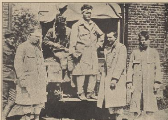
Wounded U. S. Marines Arriving at a Base Hospital