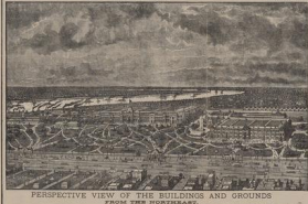
PERSPECTIVE VIEW OF THE BUILDINGS AND GROUNDS OF THE EXPOSITION.