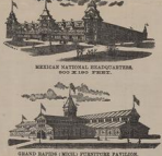
WESTERN NATIONAL GRAND DEPOT, NEW ORLEANS, LA.