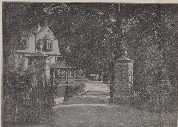
ENTRANCE TO THE FIRS