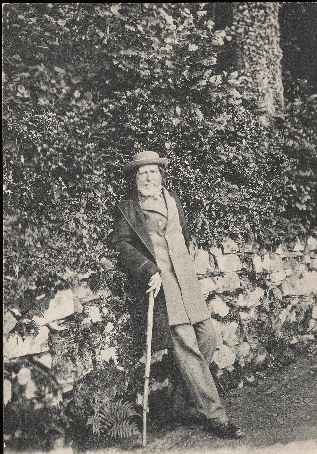
JOHN RUSKIN AT BRANTWOOD.