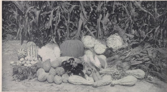
Irrigated lands are the most productive lands in America. Every farmer is his own weather man and can withhold or apply moisture to any or all crops as required, making the conditions of growth and harvesting ideal.

And the district irrigated from the Canyon Canal Co.'s system. Irrigated lands are free from trees and ready for immediate cultivation. "From sage brush to crops is only four months."