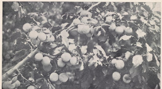
This is the way plums grow on irrigated fruit lands.