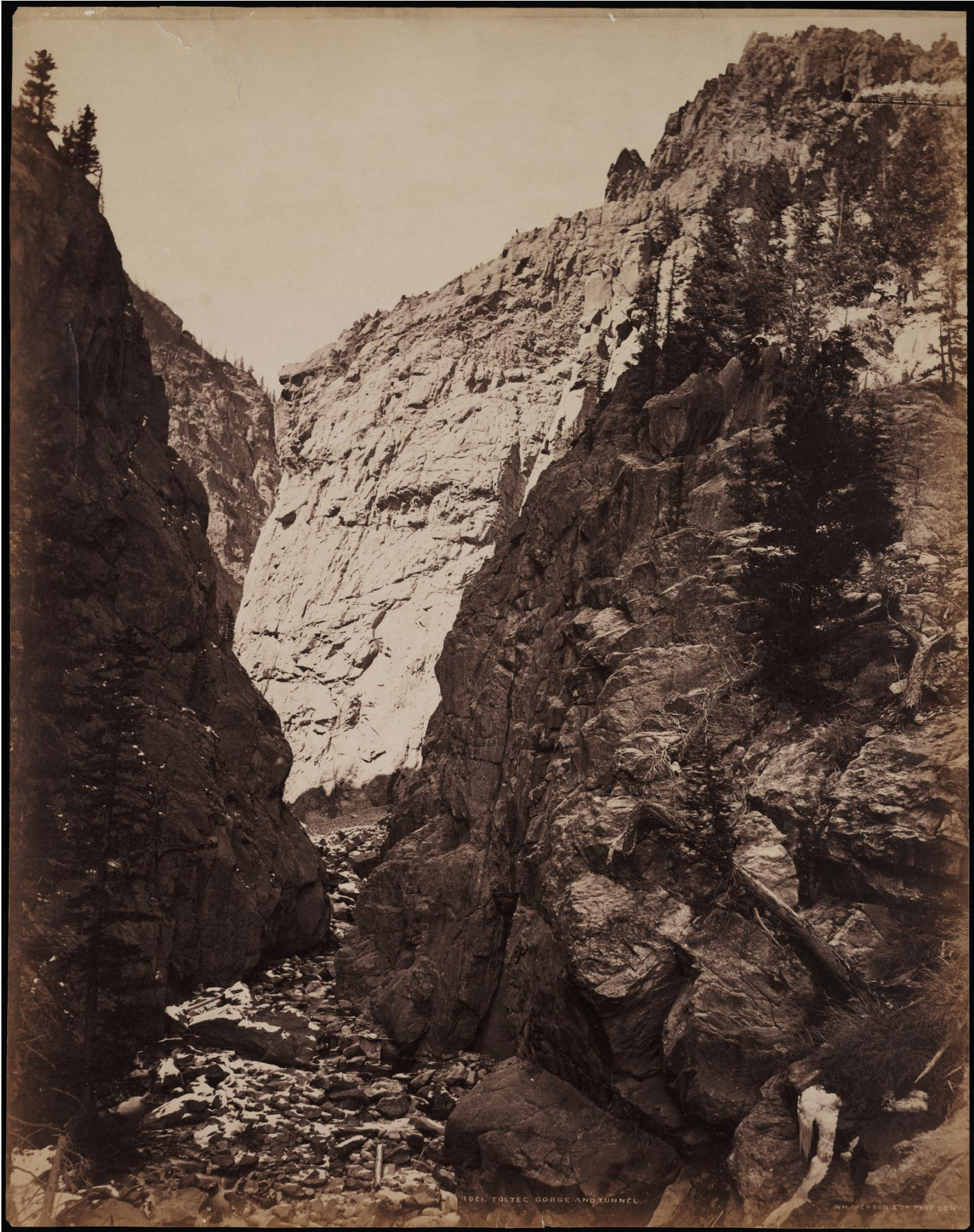
1021. TOLTEC GORGE AND TUNNEL.