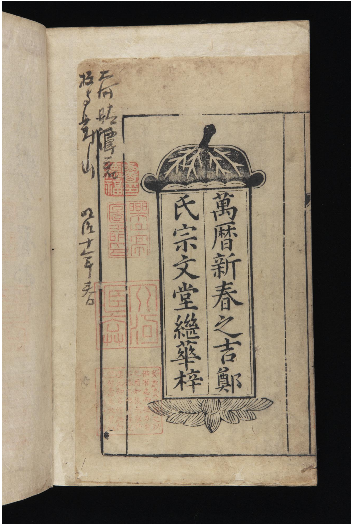
[Last printed page with red stamps]